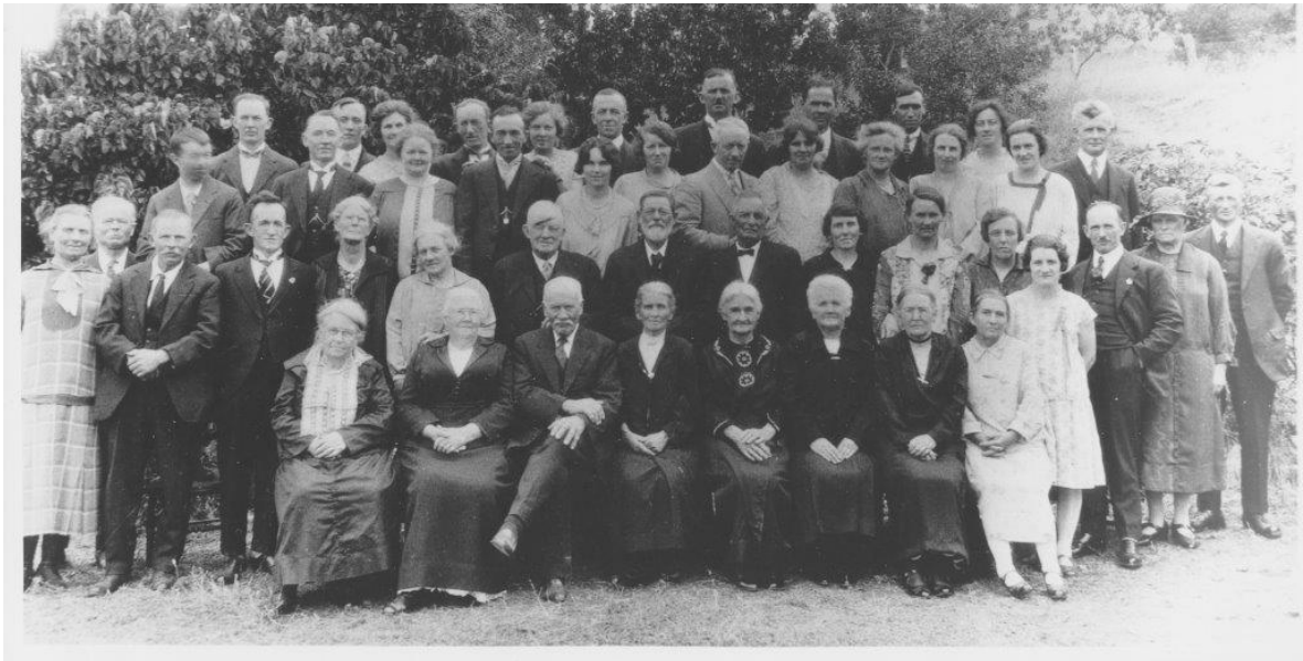
The couple celebrated their 50 th wedding anniversary in 1928, with a large gathering of relatives at the family home in Dawesley.